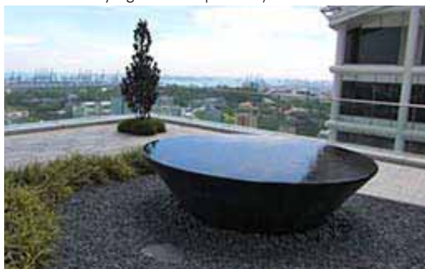
Photo shows a pond on the 22nd floor in an exposure environment

At least 25 % of the original plant species selected by the landscape consultant were replaced after the establishment period of 3 months. The main causes were light deficiency (where the set-back between the planter and the building edge exceeded 10 metres) and wind effects (causing quick drying-out and constant swaying at the top floors).