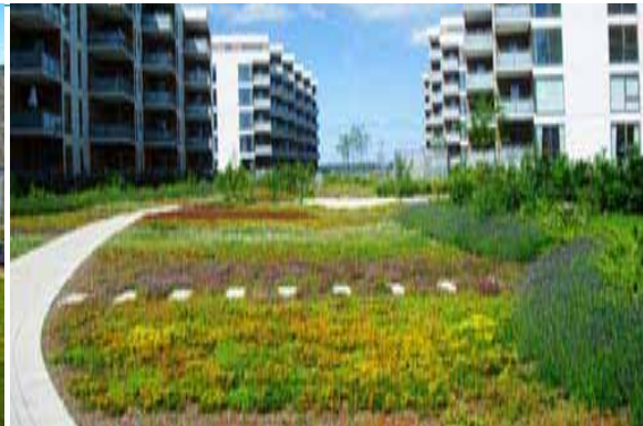
Underground garage, Holbæk