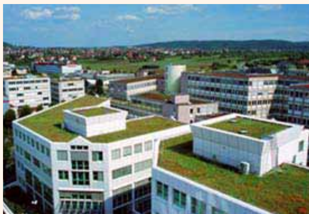
Industrial estate with green roofs in Stuttgart

But Wolfgang took me to the top of the hill to illustrate a different point relating to the more intentional cultivation of nature by humans. From the top of the hill we looked south across a large commercial-industrial area flanked by farmland, arterial streets, and rail lines. With the sun shining in our faces, the mix of warehouses and office buildings initially looked like any other you might see in the United States excepting. But looking closer, I could see that all the buildings to west of a certain point and a good portion of the newer ones to the east were topped with red and green-tinged roofs. Wolfgang pointed out that the older buildings to the east that lacked green roofs were built before the adoption of Stuttgart's requirement that all new buildings with roof angles less than 20 degrees install green roofs. Most of the others had been built with green roofs since.