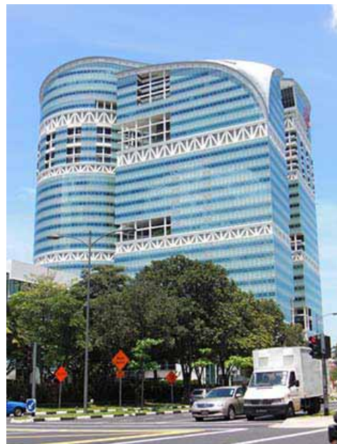
Photo shows the 3 towers of Fusionopolis