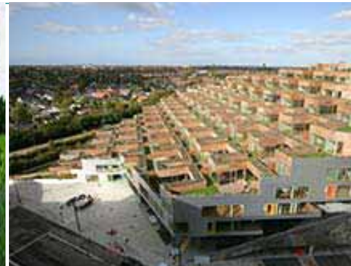
Mountain Dwellings – Best Housing Project