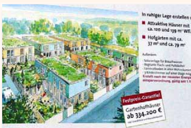
Pleasant and attractive – green roofs are part of the advertisement campaign for the new residential area

4. Local regulations in many larger German cities like Stuttgart require the installation of green roofs as a condition of development where technically feasible. In most cases that means roof with a gabled roof angle of less than 20 degrees. These requirements apply to a lesser and greater degree to current building construction and to larger urban planning zones. Stuttgart has provisions for new urban planning areas that call for over 1.5 million square meters of green roof.