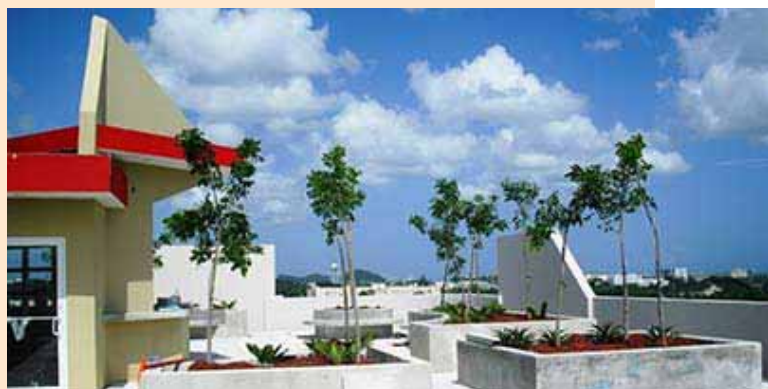
Fancy location: the green roof bar at Caribe Plaza