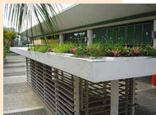
Masterpiece: Plaza del Mercado in Bayamon