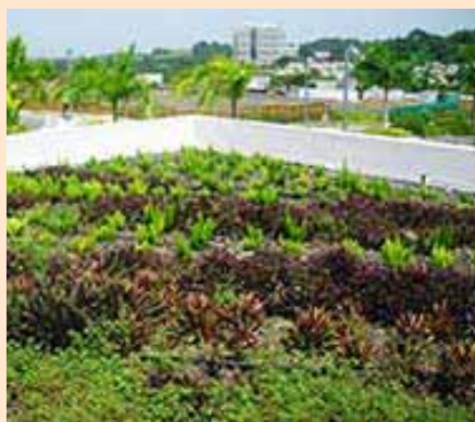
A speciality of PR Green Design: sophisticated plant mix