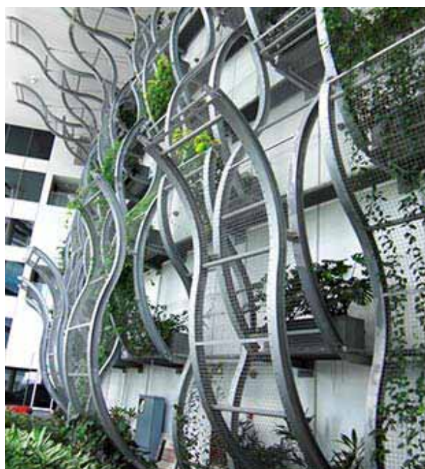
Photo shows the most impressive mesh type of vertical greenery, and it was installed on the 18th floor. The entire structure straddled 3 floors or 15 metres between floor and ceiling.

Especially at the 17th floor, rectangular planter boxes made of fibre-glass reinforced polymer were placed adjacent to a series of S-shaped steel mesh and located at various heights above the floor slab but along a common wall. There, climbers were used again to cover the mesh fully in due course.