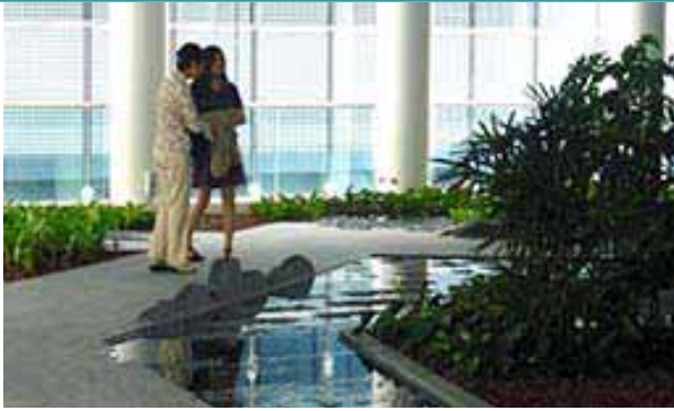
The roof gardens serve as the green lungs and social pockets for the office and lab staff